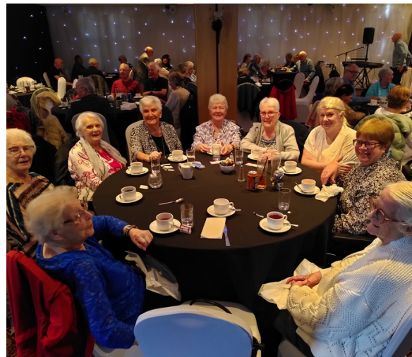
Harvest Lunch at Castlecary Hotel