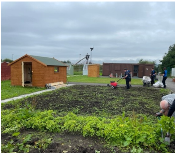
CACE Plot at Airdriehead Community Allotment

Back in July, our Open Day was a resounding success, drawing interest from the extended CACE family, local community, and friends. This year, we also embarked on an ambitious allotment project, and with the help of our volunteers and SKY partners we proudly harvested our first crops. These homegrown tatties and radishes were shared with our service users in our group services and added to the festive feast at our Harvest Lunch. Speaking of which, the Harvest Lunch was another great success this year, with overwhelmingly positive feedback. It gave us an opportunity to provide our community with an afternoon of good food, entertainment, and fun.