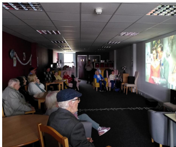
Service Users Enjoying a Showing of Easter Parade

Thank you to Cumbernauld Community Cinema who have been working with us to offer our service users the joy of big screen film showings. So far, our service users have enjoyed classics such as "Easter Parade", "South Pacific" "Blazing Saddles" and reminiscence footage of old Glasgow. This winter, we're excited to host a cozy afternoon with festive snacks and a sing along movie of "Young at Heart". If you are interested in joining any future screenings give us a call on 01236-451-393 to register your interest.