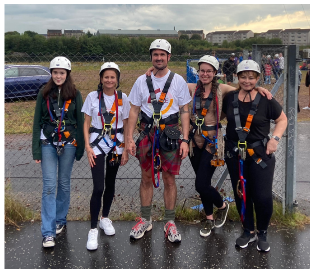
Our Brave 2023 Zip Slide Fundraisers